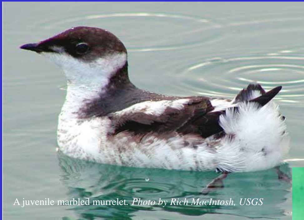
A juvenile marbled murrelet.