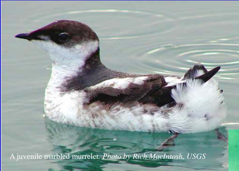
A juvenile marbled murrelet.